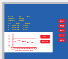
LJ/SD QC Chart